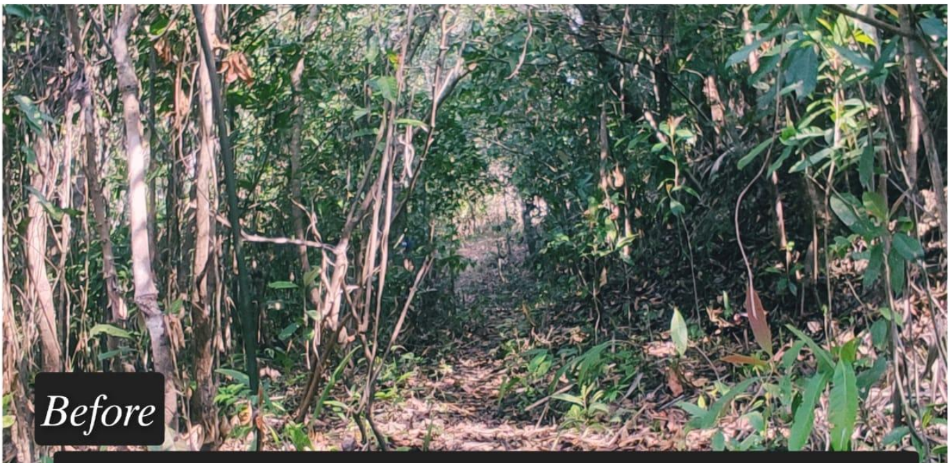
Fireline Cutting under Campa APO 2021-22 @ Melvelng Tlang